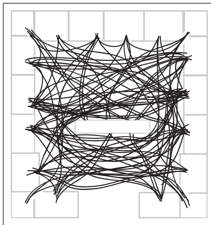
A spaghetti diagram helped map the paths nurses took through the course of one day.

H ow far does a nurse walk in a day, a week, a year? Virtua provided its Voorhees hospital nurses with pedometers and then recorded their mileage onto a “spaghetti” diagram. What they discovered was that some nurses could have walked from New Jersey to Florida in the course of one year!