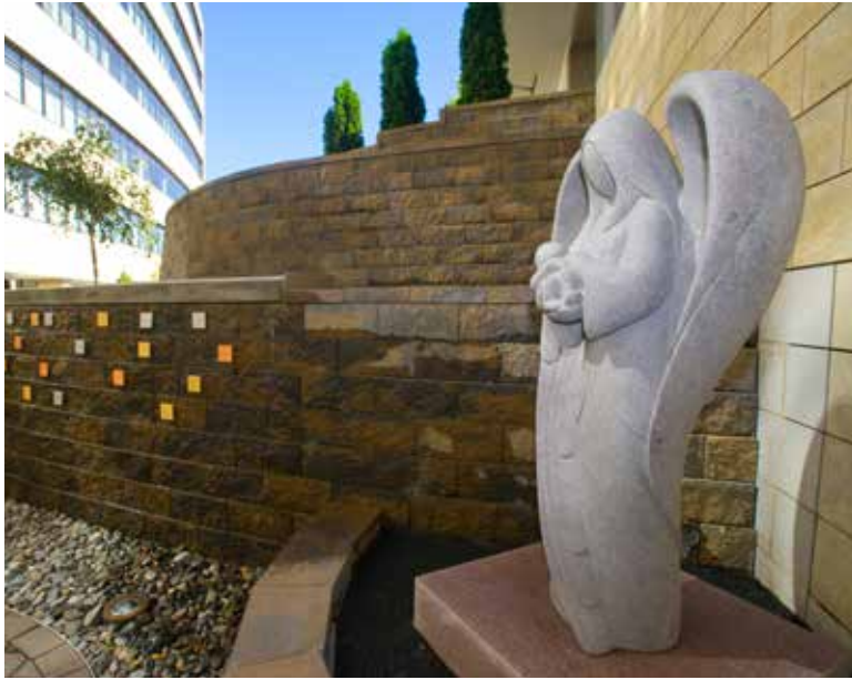
Angel Garden at Virtua Voorhees hospital